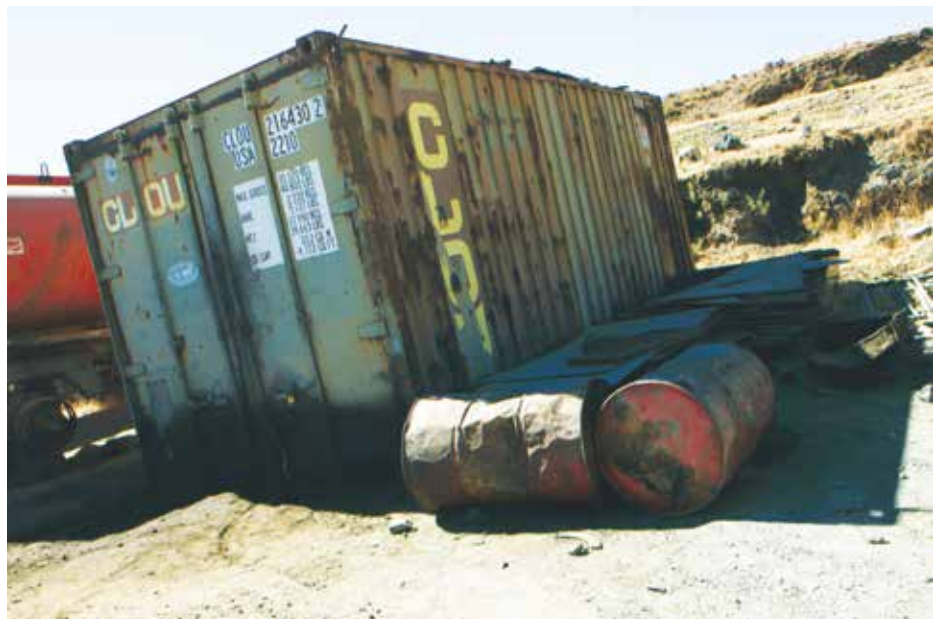
A shipping container like the one Twen shared with Helen Berhane