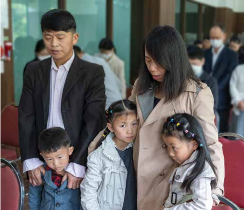
Persecution forced 60 members of the Shenzhen Holy Reformed Church to leave China for South Korea