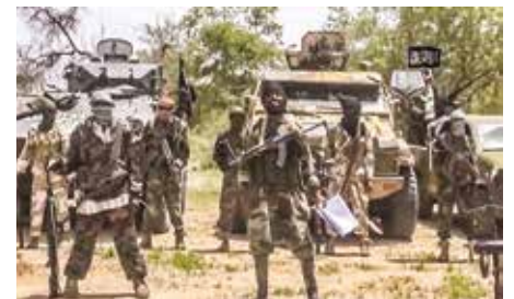
Boko Haram is one of the militant forces pushing for Nigeria to become an Islamic state

'Kidnapping for ransom has now become the major money earner for the terrorist groups while victims of rape and people living with disabilities due to the attacks continue to grow among the Christian communities. Hundreds of thousands of children in these Christian villages are either unable to go to school or cannot access any good education,' said our partner.