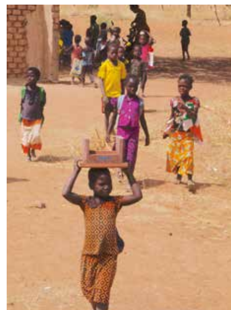
Children are among those who have had to flee

(Sources include africanews.com; aljazeera.com)