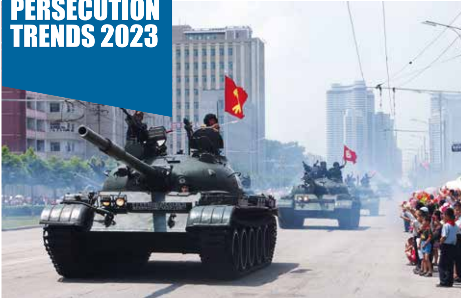
Military parades help to fuel a nationalistic spirit in North Korea