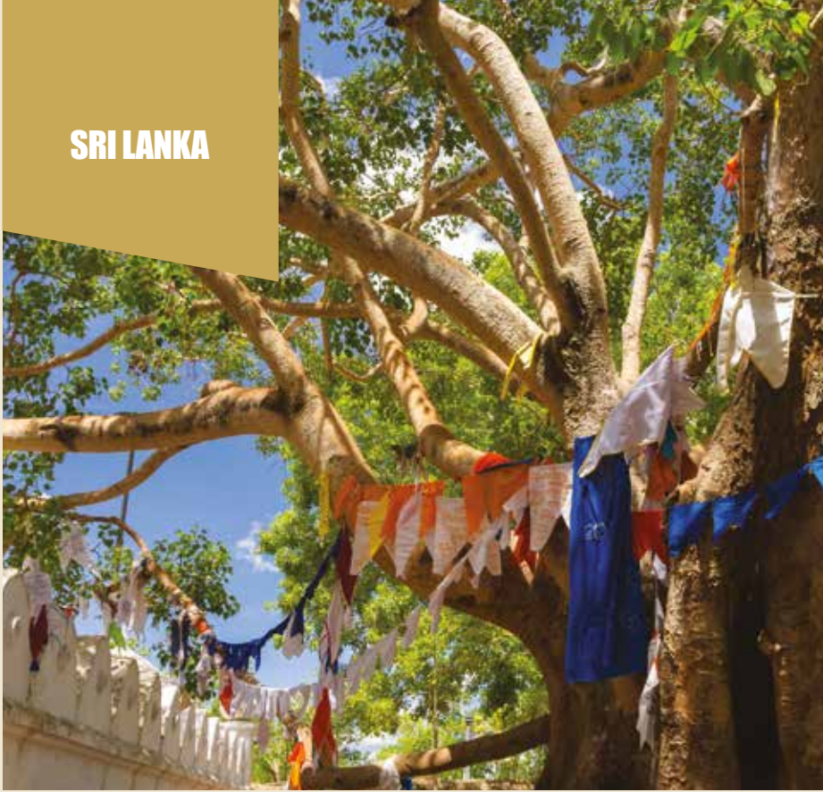
Buddhist prayer flags in Sri Lanka belie hostility towards Christians