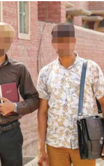
A team of young men were detained for distributing Christian literature in Pakistan – yet continue to share their faith