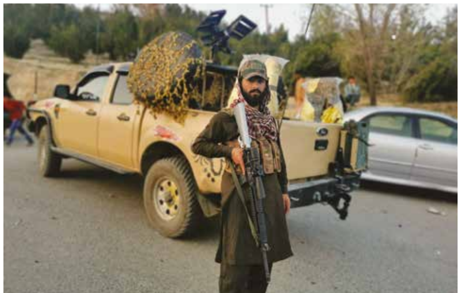
The presence of the Taliban has caused many to flee Afghanistan

Our partner said: 'Release's financial and prayer support is part of the reason why our ministry is able to continue and develop. The level of suffering in the region is huge... yet in the midst of it all, our ministry is flourishing — and seeing an increase in responses. This has to be answered prayer. Thank you for your support and prayers, especially for the vulnerable seekers and believers we minister to.'