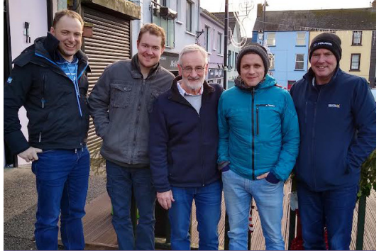
Literature Distribution Team in Cootehill