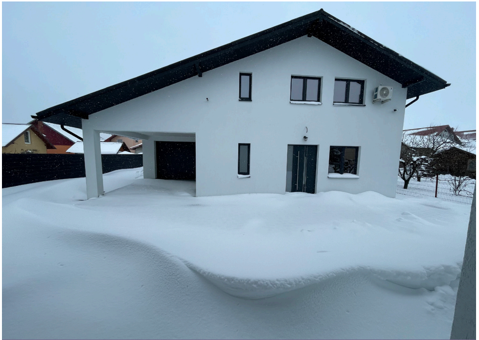
Winter - Literature Storage Facility

Having completed the building near Suceava, northern Romania, and moved a large part of the literature there, it was a major disappointment to find a pipe had burst under the foundation and completely flooded the floor space. Once the mopping up had finished the drying process started and continues to go well. Thankfully most of the stored items were on shelving and weren't affected, but there was a loss of some gospel literature.