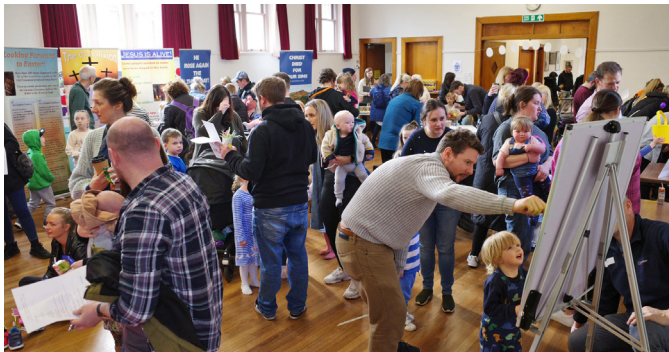
Scone Family Fun Day

Our outreach in the nearby village of Scone continues every Sunday evening with good interest from local people. We distributed a community Gospel magazine to about 2500 homes in the village in the lead up to Easter and also held a family fun day in the building we use for the Sunday outreach. We're slowly building up more contacts in the area and looking at other ways to reach out.