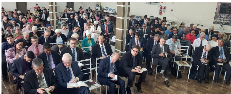
Conference in Novo Hamburgo

Yesterday, we were at the annual conference in Novo Hamburgo. It was four years since we were able to meet in person with the saints in this town and we were not disappointed.