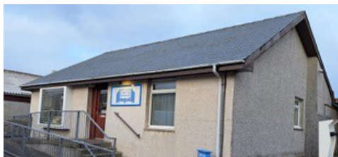
Shetland Christian Bookshop

of each assembly served 'tea and tray bakes' after every meeting, which gave time for informal questions, especially from visitors. Each Lord's day had two gospel meetings, and the meetings ran through Saturday evenings as well.