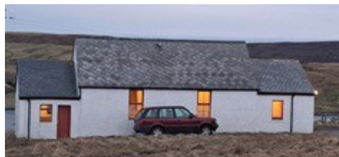
Selivoe Gospel Hall (West Shetland)

There was great encouragement however when the son of one the older brothers came back to the Lord after many years. His recovery, baptism and coming into fellowship has kept the testimony alive in what was the smallest and most remote assembly. The recent series of meetings was shared among four assemblies, with the 'speaker' being moved around on a 'half week' basis. We began in Selivoe - at the request of the brother there - and then south to Scalloway, north up to Brae, and down to Sound at Lerwick. The topics were part ministry, part gospel, on a chapter by chapter look at the Book of Revelation. Increasing numbers of visitors attended, from almost every denomination on the island. Some nights almost 40% of the audience was from outside the assemblies. The sisters