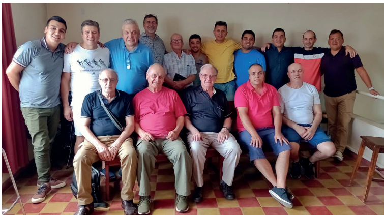
First time retreat for Elders in rural area

meeting of the elders and their wives of four rural assemblies. Only three were over 50 years of age. This proved to be more exhausting than anticipated because of the longest heatwave on record, with temperatures over 40°C some days, and no thunderstorms to cool things a bit. Apart from the ministry, they were all uplifted by meeting each other, most for the first time.