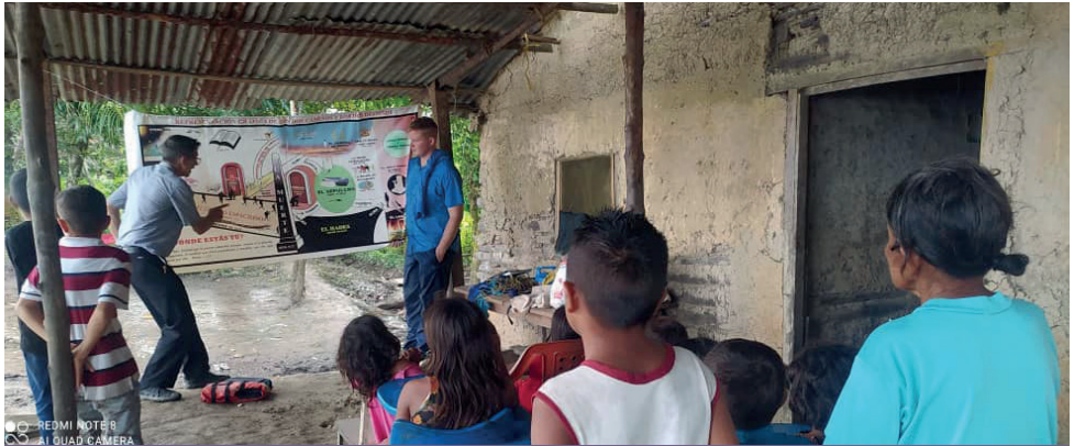
Visit to indigenous communities

This year we have mainly been kept busy with gospel meetings and children's meetings in different areas. It is encouraging to see an interest wherever the gospel is preached. People are usually quite willing to accept invitations to hear the gospel. It is unusual for them when they see the order in the assembly gatherings, and that no collections are made. There is so much around us that has brought disgrace to the blessed name of