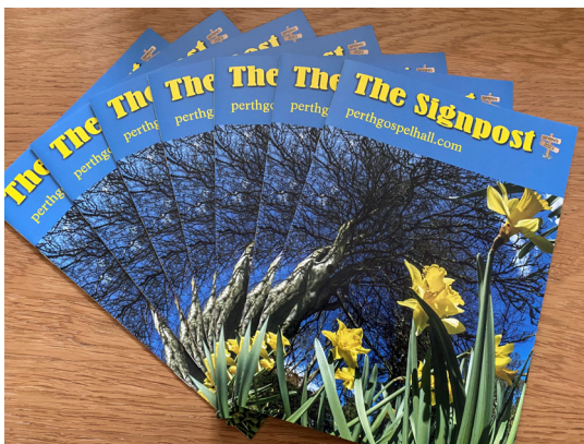
PGH Signpost Magazine

Numbers attending our two weekly soup kitchens have increased in recent months. A group of young Sri Lankans were attending quite regularly for a while and other new contacts have been made. While there are some who show an interest in the Gospel that's preached each week it's also been sad in the last couple of months to attend the funerals of two men who used to come along.